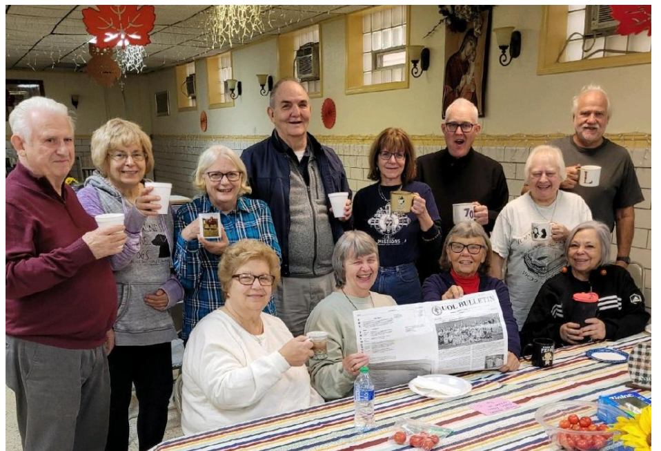
Members of the Sts. Peter and Paul Senior UOL chapter in Carnegie enjoying the UOL Bulletin during coffee hour.