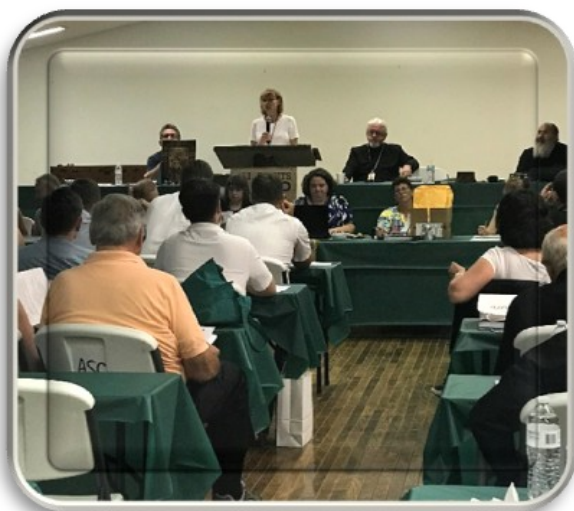
72nd Convention Body Meeting at ASC